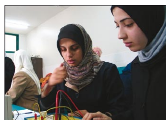
Undergraduate students at work in the IUG laboratory for electronics.

ICO established the Galileo Galilei Award in 1993 to recognize outstanding contributions in the field of optics that are achieved under unfavourable circumstances. According to the rules of the award, outstanding contributions include advances in fundamental scientific questions or problems; research or development of optical methods or devices; or scientific or technical leadership in the establishment of regional optical centres. Winners will have experienced difficult economic or social conditions, or a lack of access to scientific or technical facilities or sources of information.